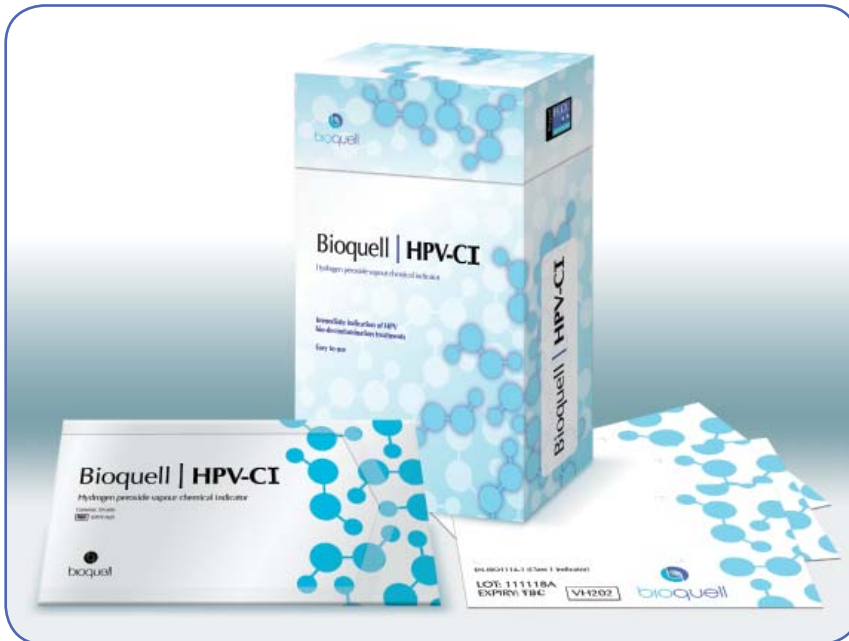
Image 1. Bioquell HPV-CIs provide a simple, easy to use indication of a successful Bioquell HPV bio-decontamination process

Bioquell HPV-CI is a simple visual indicator of the effectiveness of a Bioquell hydrogen peroxide vapor (HPV) bio-decontamination cycle. It has been developed to complement standard biological indicators*.