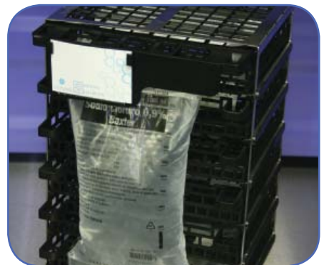
Image 3. After a Bioquell HPV bio-decontamination, the color of the indicator portion can be used to provide an early indication of the reduction in bioburden (e.g. >6-log)